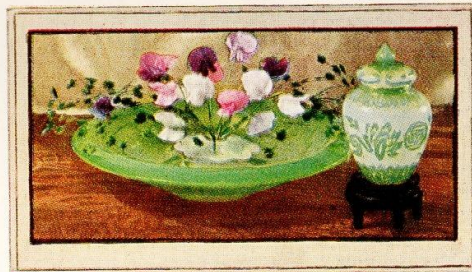
Fluent contours, cool exquisite colors characterize Steuben glass designed for summer entertaining. It may be had in single pieces or entire sets—such as this of crystal and rose hued Grenadine—in Jade Green, Amber, Celeste Blue and other lovely shades

The blossoms of summer's gardens are matched in their variety by the individual grace of the many Steuben vases. Two of the delightful forms originated at Steuben Furnaces are shown below in Jade Green