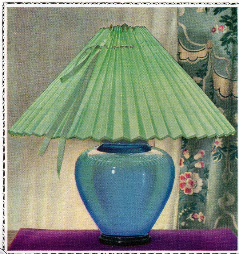
A lamp made from a water jar of gorgeous blue. Equally fascinating are lamp bowls of ruby red, of amber, Spanish green, or amethyst

Every piece in the Steuben collection is designed by an artist glass-maker honored