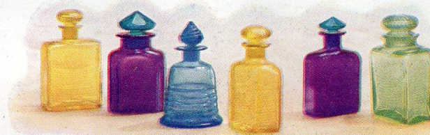
The new bathroom bottles! Used in sets all of one color or in whatever way your decorative scheme requires

on two continents for his masterly achievements. Under his direction, craftsmen with that rare delicacy and sureness of touch which distinguish the worker in the arts from other men, fashion by hand each lovely piece.